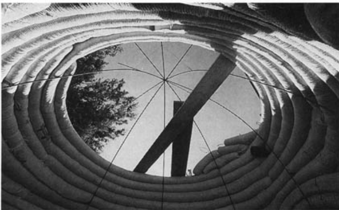
Double-curvature compression shell, or dome, of Superadobe construction showing rebar guides for the dome shape (removed later) and a simple plank scaffold. Gravity is the generator of the form.

1. Single- and double-curvature compression shells transfer their stresses along the surface of the structure and not from element to element like column- and beam-type buildings. When a single element in a beam and column construction is overloaded to failure, the loss of that element will create a cascading effect on adjacent elements, causing failure of all elements in the vicinity.