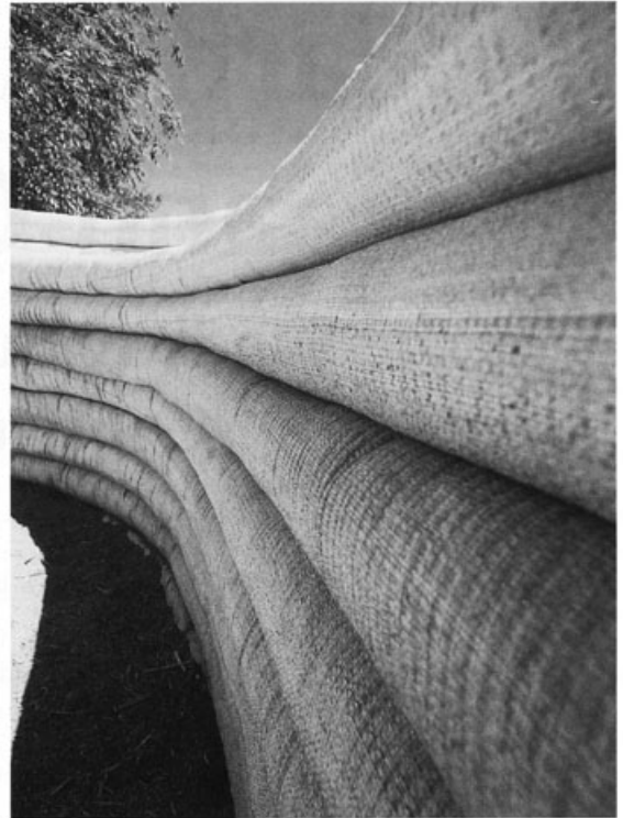
Wall of Superadobe construction—earth-filled sandbags and barbed wire. Coils/courses can be filled by hand or by pump at speeds of 10 to 15 feet per minute, depending on bag width.

Superadobe uses four-point barbed wire (or a similar element) between sandbag layers, allowing one to develop the tensile and shear capabilities that have not been previously achievable. The barbed wire element increases the friction factor between the bags and creates tensile resistance in a wall or structural element. It is an important aspect of Superadobe to provide for the