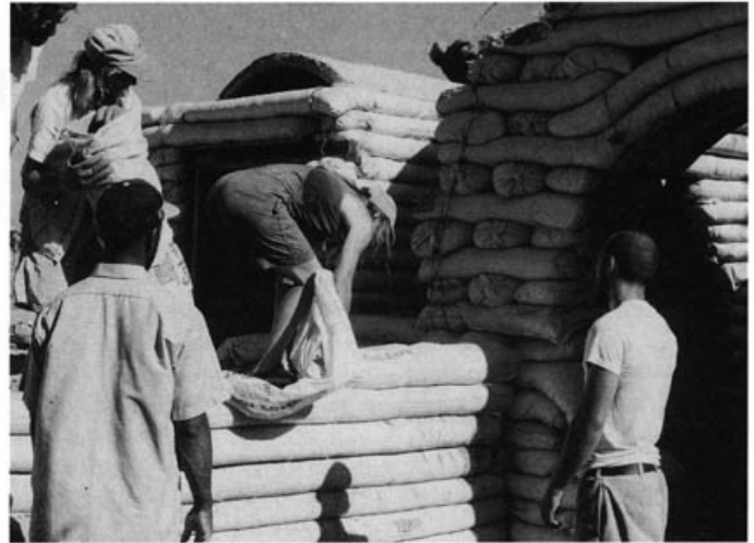
Trainee builders work with hand-filled Superadobe. Long sandbags are filled with earth from the site and tamped in place on the wall. Between courses are set two strands of four-point barbed wire.

ity. In many cases, this will cause the entire structure to collapse, as was witnessed in earthquakes in Northridge, California, and Kobe, Japan. Such a structure is only as strong as its weakest element. In a dome, and to a lesser degree a vault, excessive loads on their surface will first cause a puncture failure. This results in the excessive load being shed with only localized damage; the remaining stresses in the vicinity of the failure are transmitted around the failed area, and other loads continue to be held by the structure without any problem.