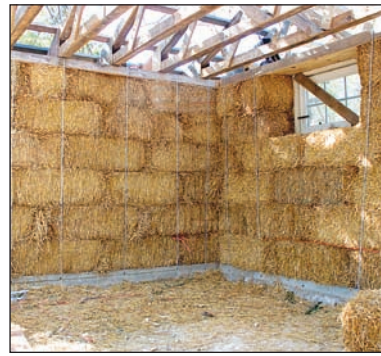
Interior of load-bearing straw bale house showing plastic mesh compression straps.