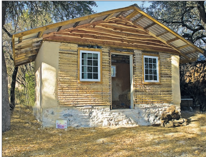
This load-bearing straw bale hybrid house sits on a stem wall of limestone collected from the building site, and features roof trusses made of wood salvaged from shipping pallets. The exterior has earthen plaster on three sides, with the fourth—the front of the building—consisting of straw-clay and site-milled cedar lath.